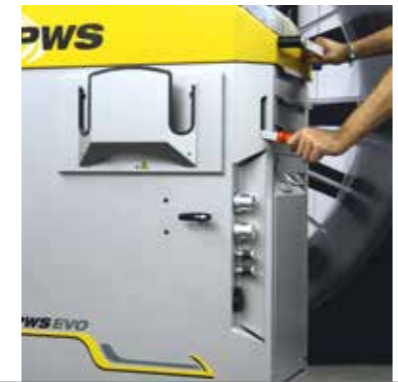
Parking Brake - safely locks the steerable wheels