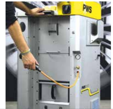
Integrated self-retracting Cableroller with 6 meters of industry grade power cable