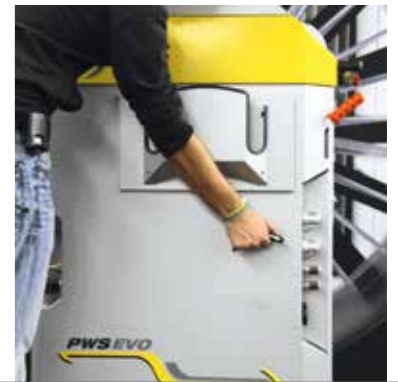
Switch for Double-Jet-Suction connector