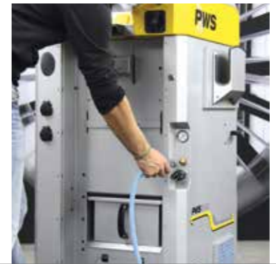
Connection for Air Pressure Supply