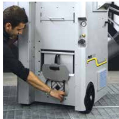
Easy access Hatch to clean filter of the turbine