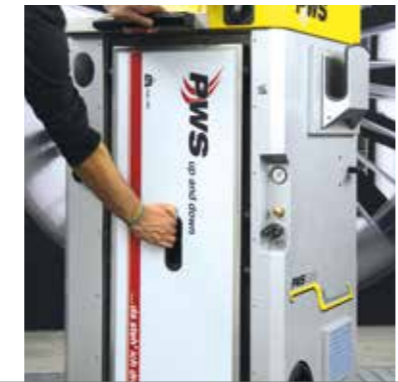
Up and Down - integrated foldable footboard step ladder