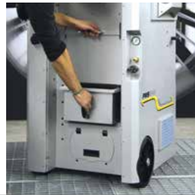
Removable 10 liter Dustcontainer for easy removal of dust